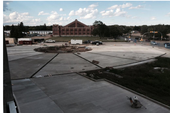
Roughriders Fan Plaza under construction August 2016

Within the plaza a central platform supports a decorative monument (statue). A bosque of Tree Lilacs creates a shady counterpoint to the monument on the south side of the plaza. The surface of the plaza slopes slightly down toward the central platform. The surface is city standard poured concrete but contains lines of black-coloured concrete radiating from the central platform.