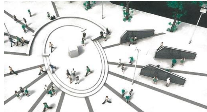
Roughriders Fan Plaza marketing image based on digital model November 2016